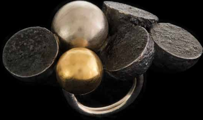
GIGI MARIANI Ring Silber 18kt Gold Niello, 2024